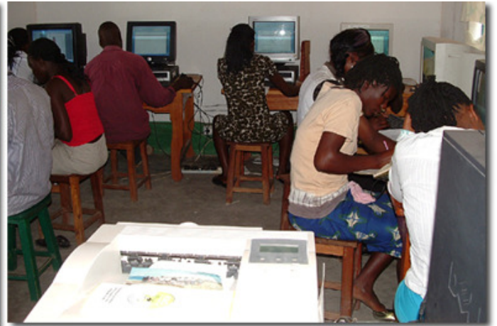
The IKSDP Internet

Point of Nyandiwa, since 2004 provides its services to neighboring villages and throughout the region, powered by solar panels. The specialized staff helps users to use the internet, to write and print documents, photocopying, fax and E-mail. The success of the services and the Computer courses for the community and for the College students, the need to know how to use ICT is becoming