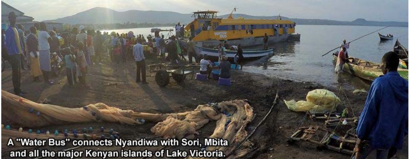
A "Water Bus" connects Nyandiwa with Sori, Mbita and all the major Kenyan islands of Lake Victoria.

Association IKSDP-Harambee Project NGO, via Burigozzo 11, 20122 Milano (Italy)