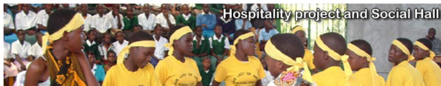
Hospitality project and Social Hall