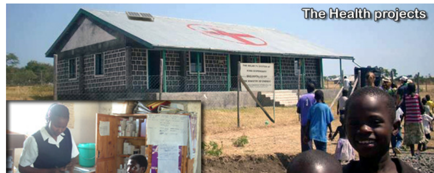
The Health projects

The priority projects are: to provide the health facilities for basic and urgent care to villages that don't have dispensaries nearby and carry out the activities of hygienic - health education and also prevention diseases. The medical dispensaries of Kisaku and Kiwa were constructed under the