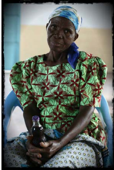
"To live long is to see much" (Swahili proverb)