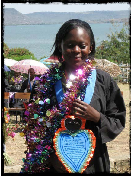
"Knowledge is power" (Swahili proverb)