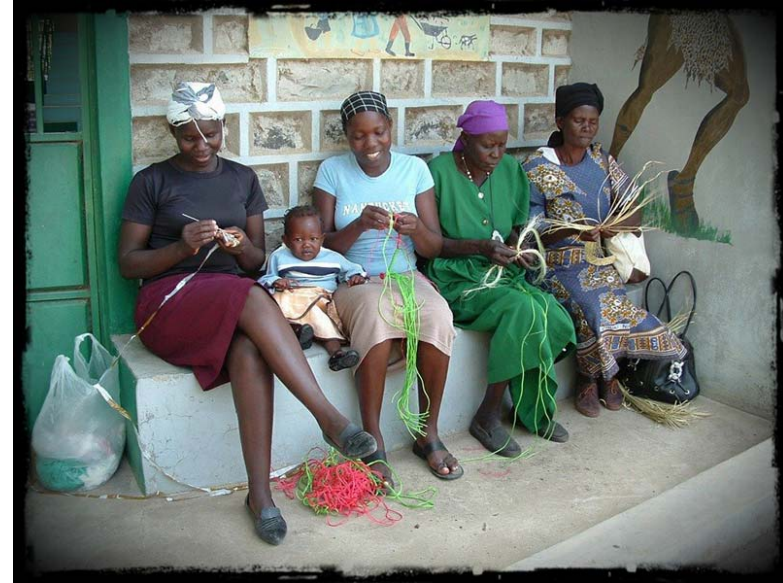
"Everyone should contribute when collection is made. " (Swahili proverb)