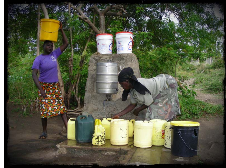
"One drop after another fills the glass" (Swahili proverb)